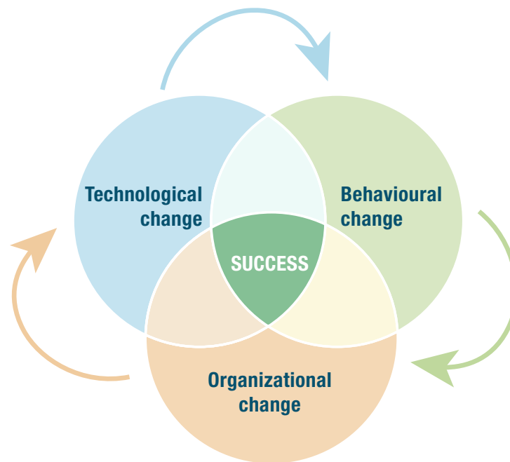
Figure 1 Keys to success

Technology alone cannot achieve optimal savings, but when coupled with operations and maintenance practices, as well as management systems, it can lead to significant savings. Figure 1 illustrates how integrating organizational, technological and behavioural change is a continuous, dynamic process. Integrating an energy management culture with operational and technological actions is required for optimal results. Employee behaviour is also crucial because it puts people in the "feedback loop" and is supported by celebration and recognition of results.