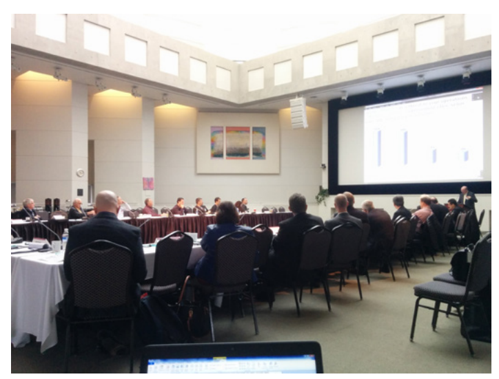
Industry Technical Information Sharing Meeting

The CRIRN Industry Technical Advisory Group is a forum of energy and utilities sector network members, including stakeholders from industry, industry associations, NRCan portfolio agencies, and academia. The group was created to provide NRCan's CRIRN subject matter experts with industry operational knowledge, perspective and advice to help enhance the security and resilience of critical resources infrastructure systems.