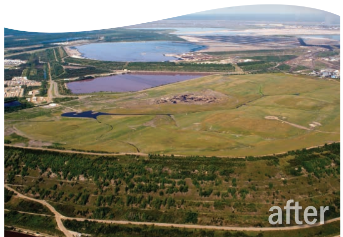
Suncor Pond 1, Aerial View, August 2011