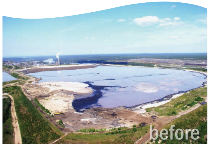
Suncor Pond 1, Aerial View, 2002

All tailings ponds are constructed with groundwater monitoring facilities that are designed to capture and recycle material that may seep from the ponds. The 2011 Lower Athabasca Water Quality Monitoring Program was developed to provide more data to track changes in water quality, assess the cumulative effects of oil sands activities and inform any necessary mitigation.