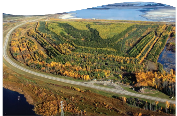
Syncrude's Gateway Hill was recently certified reclaimed by the Government of Alberta.

The oil sands are found in western Canada and are located within the boundaries of Canada's boreal forest, which stretches more than 5,000 km (3,100 mi.) from coast to coast and covers about 30 percent of the country's land mass. 1 The total area of the oil sands that is accessible through surface mining represents 0.2 percent of Canada's boreal forest.