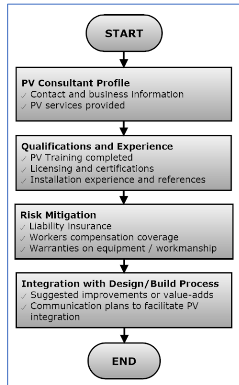
Figure 2: Overview of the Solar PV Consultant Interview Checklist

The following sections provide background and context on how the information collected may be used when selecting a solar PV consultant.