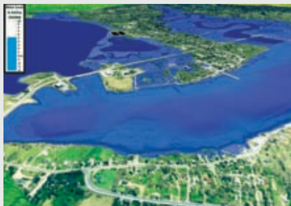
The Groundhog Day storm with 50 years of projected sea-level rise.

To develop improved flooding maps, the Applied Geomatics Research Group conducted a LiDAR survey that used an airborne laser to scan the ground to obtain elevation data to an accuracy of \pm 15 cm. The team then created flood risk maps with these data, GIS and software developed in-house, called “the Water Modeller.” The 1976 Groundhog Day storm, during which a high tide coincided with a storm surge, was used as benchmark for flooding. An accurate record of water levels achieved during the Groundhog Day storm was obtained from the tide gauge in Saint John, New Brunswick, which lies across the Bay of Fundy from Annapolis Royal. Future sea-level rise from climate change was then incorporated into the risk statistics and the final maps. To calculate sea levels, the following factors were considered: