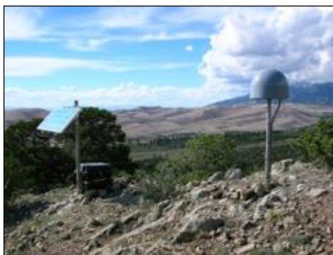
Figure 5 : Braced monument (UNAVCO, 2012)