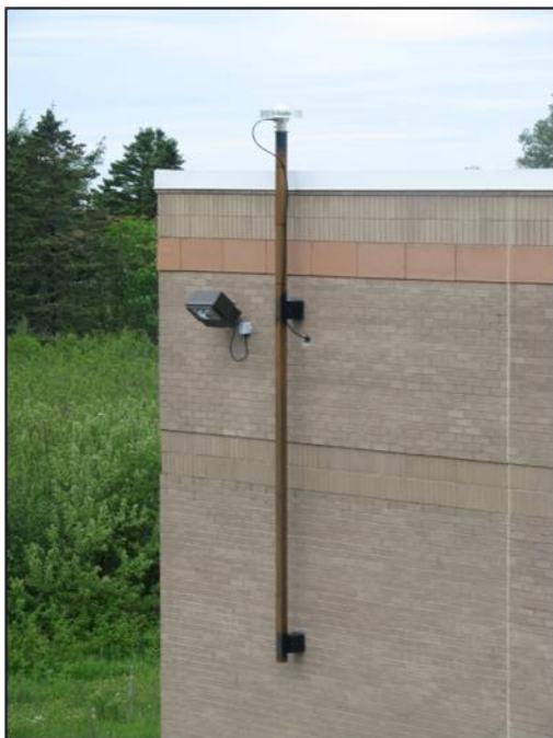
Figure 6 : Antenna mast attached to a load bearing wall

Despite having metal siding, the building in Figure 8 has a concrete inner wall. The antenna mast is mounted to the concrete inner wall using through bolts (Figure 9).