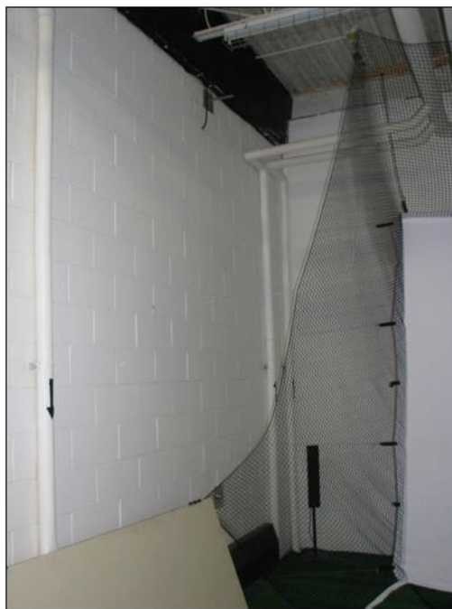
Figure 7 : Through bolts for mounting