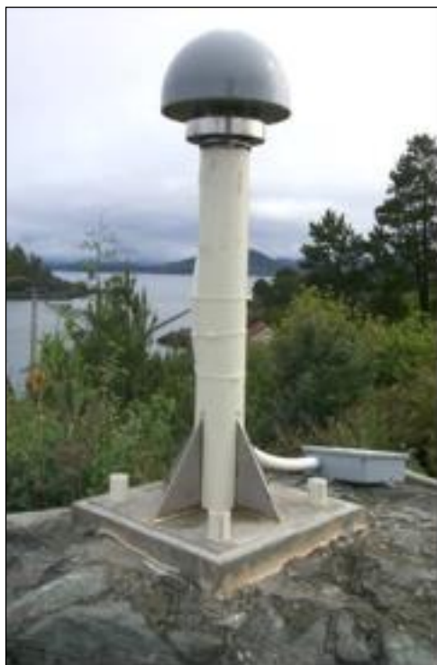
Figure 3 : GPS pedestal monument (Schmidt et al., 2000)

http://kb.unavco.org/kb/category/gnss-and-related-equipment/monumentation/deep-drilled-braced/109/