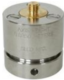
Figure 2: Antenna Mount

The antenna should be oriented to true north using the convention of aligning the antenna cable attachment point, unless the antenna has a different inscribed North point. Remember that declination is the angle between magnetic north and true north. A magnetic declination calculator for setting a compass correctly is available at: http://geomag.nrcan.gc.ca/calc/mdcal-eng.php . The declination used should be recorded in the