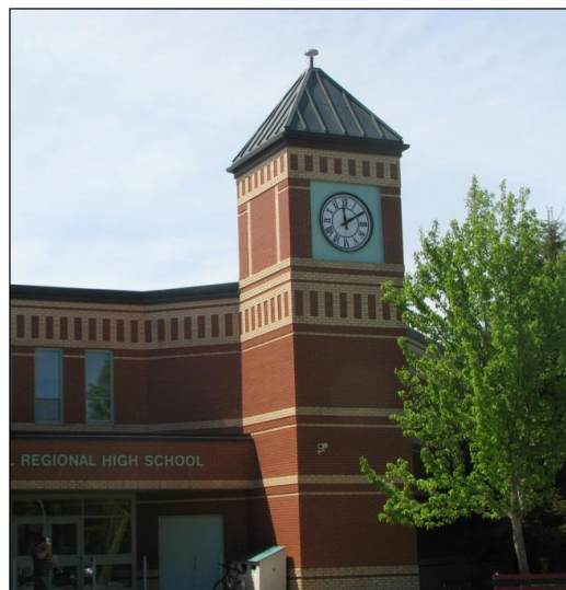
Figure 10: Spire installation

Some locations, such as the one shown in Figure 10, necessitate some ingenuity. Nearby obstructions made the best choice for antenna location at the top of the spire. The antenna is fastened directly to structural steel.