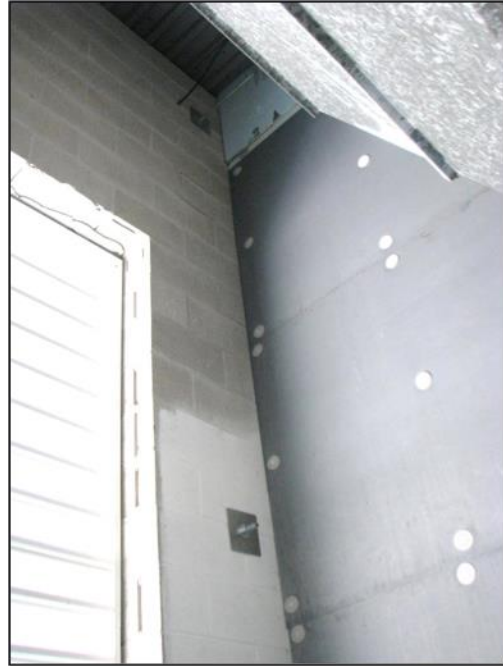
Figure 9 : Through bolts in concrete inner wall

Some locations, such as the one shown in Figure 10, necessitate some ingenuity. Nearby obstructions made the best choice for antenna location at the top of the spire. The antenna is fastened directly to structural steel.