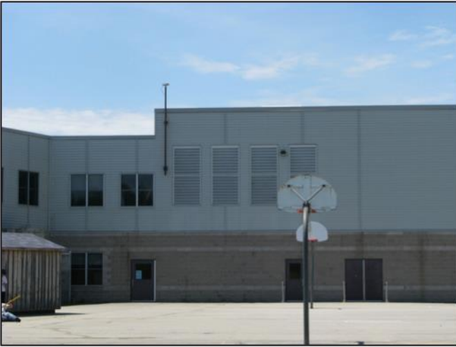
Figure 8 : Metal siding with concrete inner wall installation