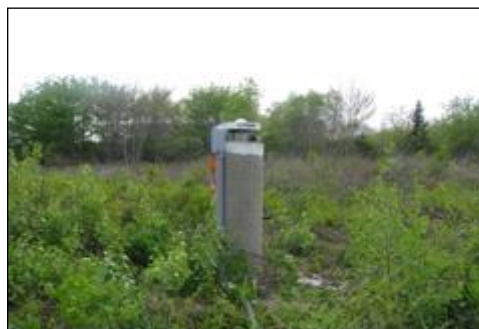
Figure 4 : Ground based, concrete pillar monument