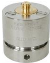
Figure 2: Antenna Mount

The antenna should be oriented to true north using the convention of aligning the antenna cable attachment point, unless the antenna has a different inscribed North point. Remember that declination is the angle between magnetic north and true north. A magnetic declination calculator for setting a compass correctly is available at: https://www.ngdc.noaa.gov/geomag/calculators/magcalc.shtml . The declination used should