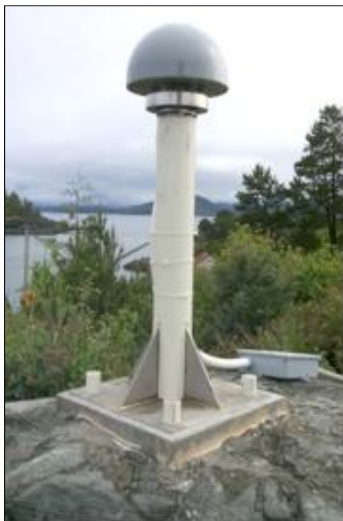
Figure 3 : GPS pedestal monument (Schmidt et al., 2000)

https://kb.unavco.org/category/gnss-and-related-equipment/monumentation/deep-drilled-braced/109/