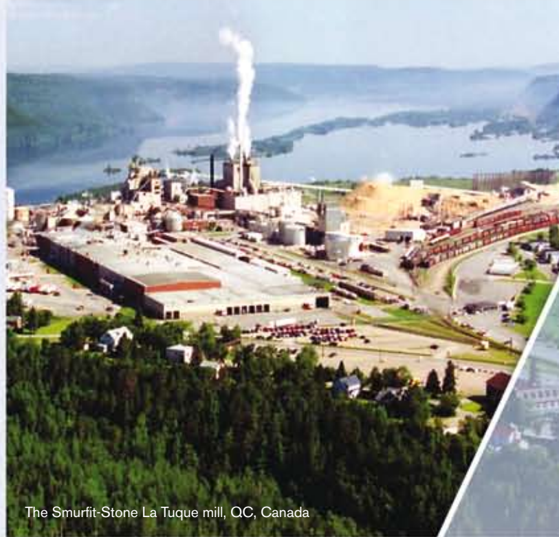
The Smurfit-Stone La Tuque mill, QC, Canada