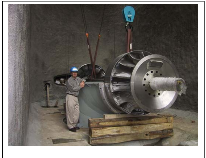
Improved Camelback Francis Turbine in the No. 11 Powerhouse, Energy Ottawa

A key component of CanmetENERGY's activities is the Laval University Hydraulic Machinery Laboratory (LAMH) in Québec City. LAMH is the only independent hydro turbine testing laboratory in Canada and one of the top five labs worldwide at measuring the accuracy of turbine efficiencies. LAMH was developed through the support of CanmetENERGY and Laval University. The lab validates new hydro turbine designs with improved efficiency and provides educational facilities to train future engineers and researchers. The importance of LAMH is also recognized by major turbine manufacturers who carry out R&D projects with the